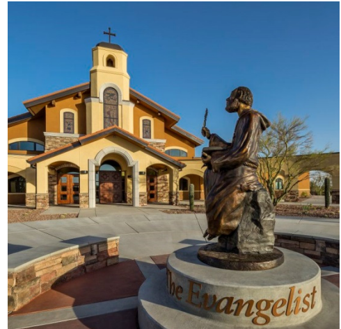
St. Mark Statue - Courtyard