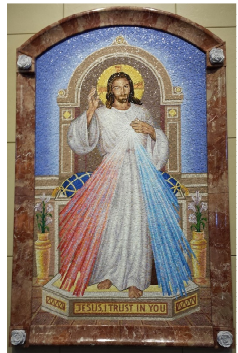
The Divine Mercy mosaic

Each Transept has a Rose (round window) at the top with two of the four Evangelists shown beneath it at eye level on either side of the Transept. To the left of the Altar in the Transept, the Rose window shows the Holy Spirit, and the two Evangelists depicted are Matthew and Mark. On the right side, the Rose window shows the Madonna and Child, and the Evangelists depicted are Luke and John.