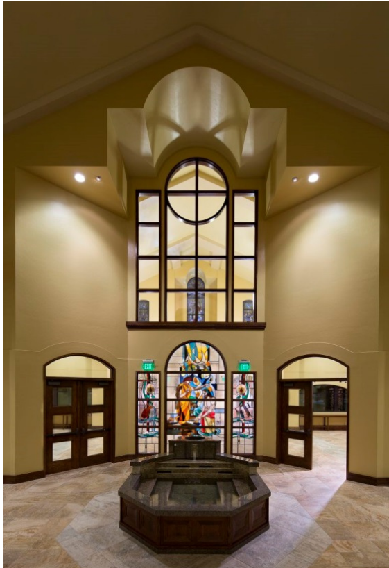
Baptismal Font and stained glass depicting the Baptism of Jesus